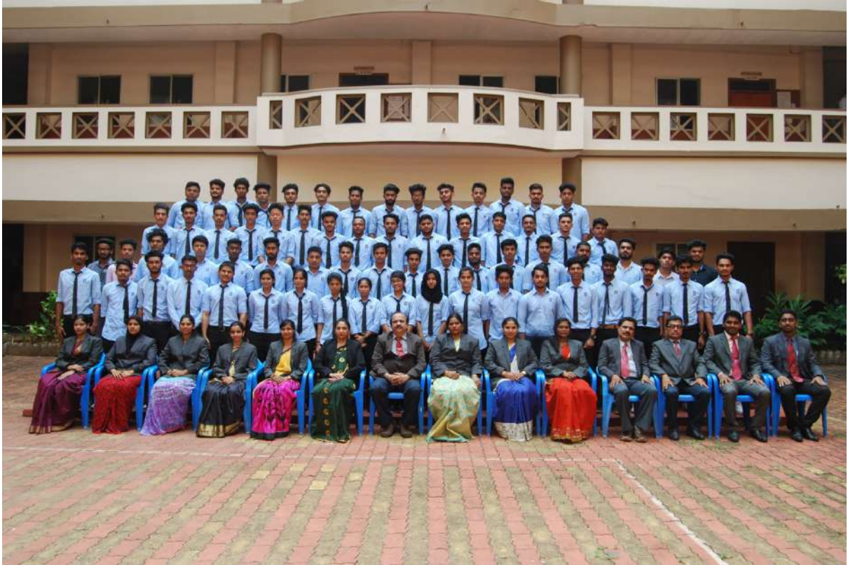
I Semester BBA