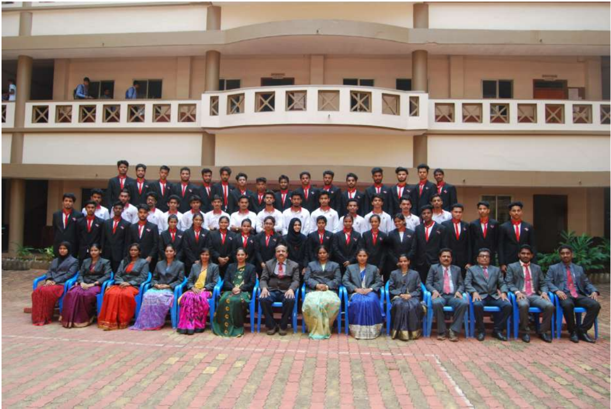
I Semester Aviation Management