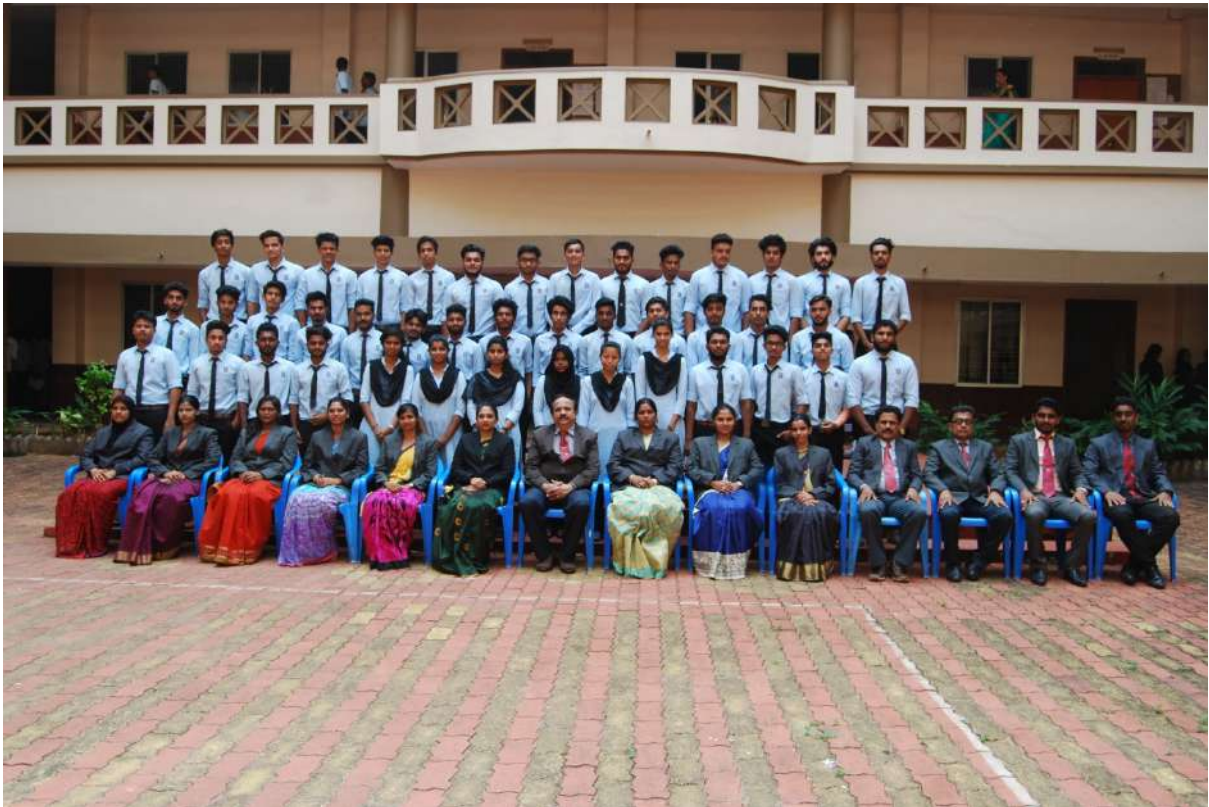
I Semester B.Com.