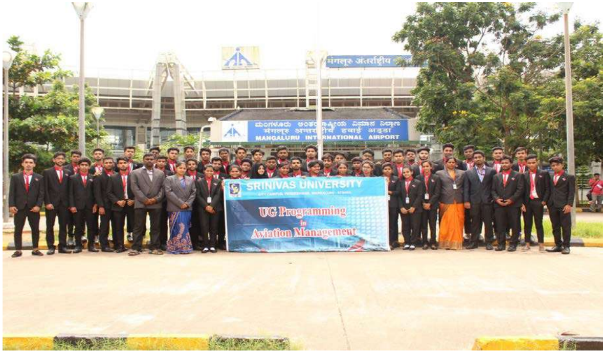
Industrial visit to Mangalore International Airport, Mangaluru by Aviation Management Students