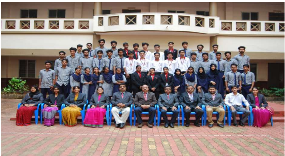
I Semester BCA