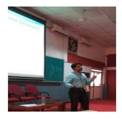
Date : 27<sup>th</sup> July 2018