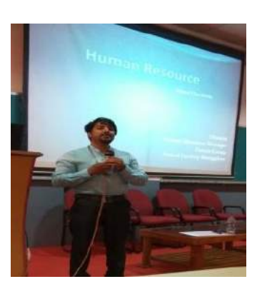
Venue : Gallery Hall, SIMS, Pandeshwar

A Guest Lecture was organised by the Department of Business Management & Commerce, SIMS, Pandeshwar Campus of Srinivas University for its II year III Semester MBA students.