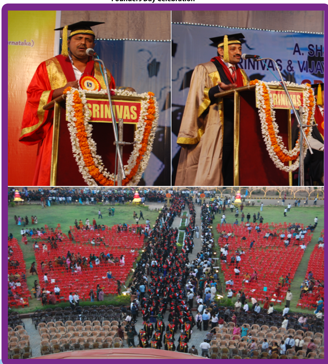
Graduation Day Celebration