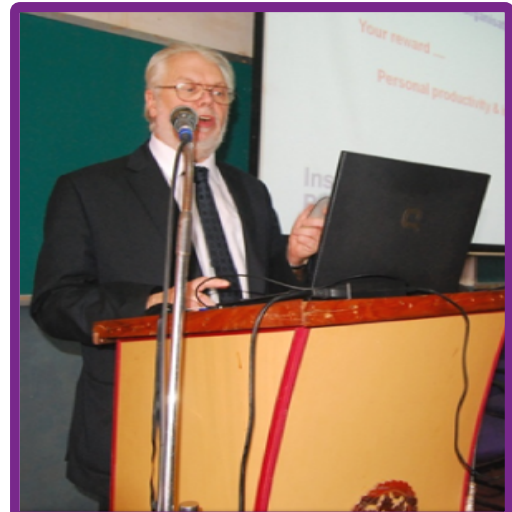
aZ` Vb BcbXeadG=