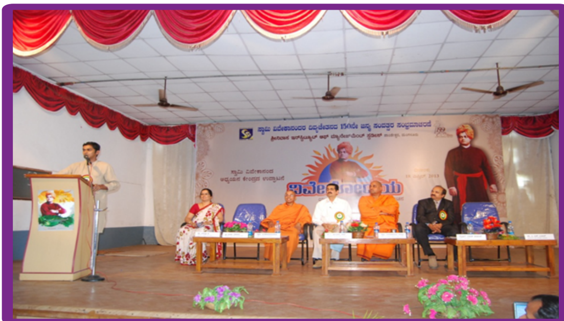
Vivakanada Udaya Program conducted by Ramakrishna Mutt