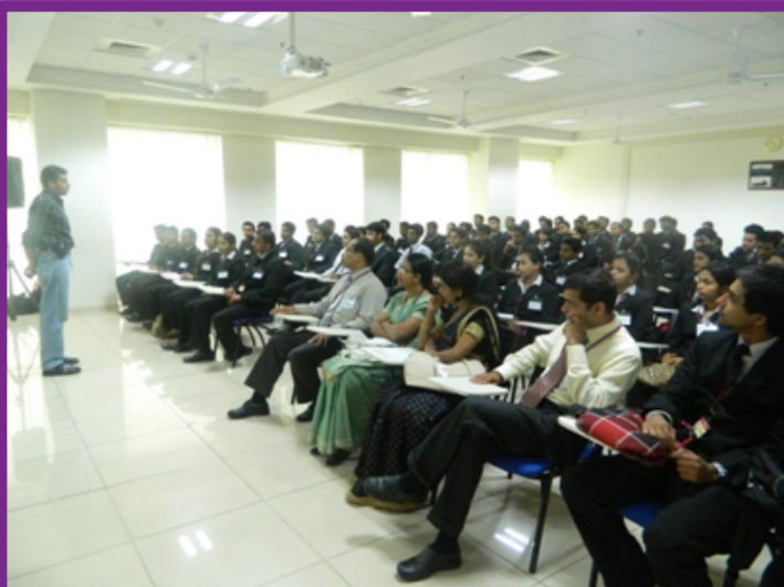
Infosys Campus Connect Programme