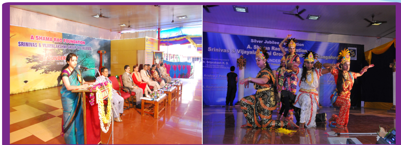
Founders Day Celebration