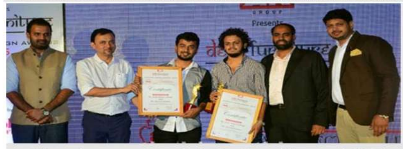
SSA students receiving Delhi Furniture- IIA award-2016

SSA won second overall runner's up of zone NASA 2018, hosted by Siddaganga institute of technology, Tumkur