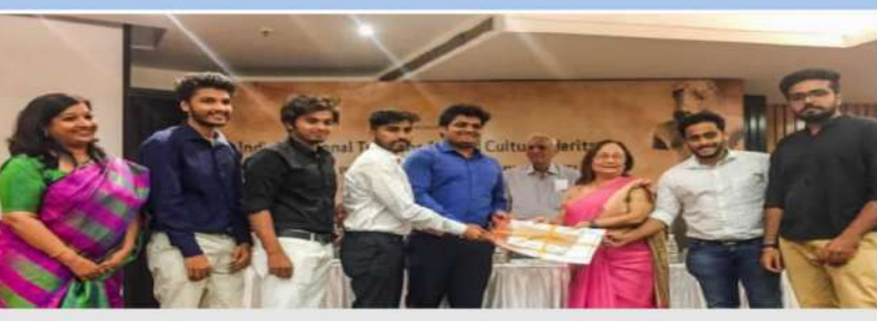
AWARD 2016 INTACH HERITAGE AWARD 2017 For excellence in documentation of unprotected heritage