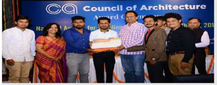
INTACH HERITAGE AWARD 2016 For excellence in do