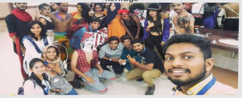
Infosys Fashion show award- 2016