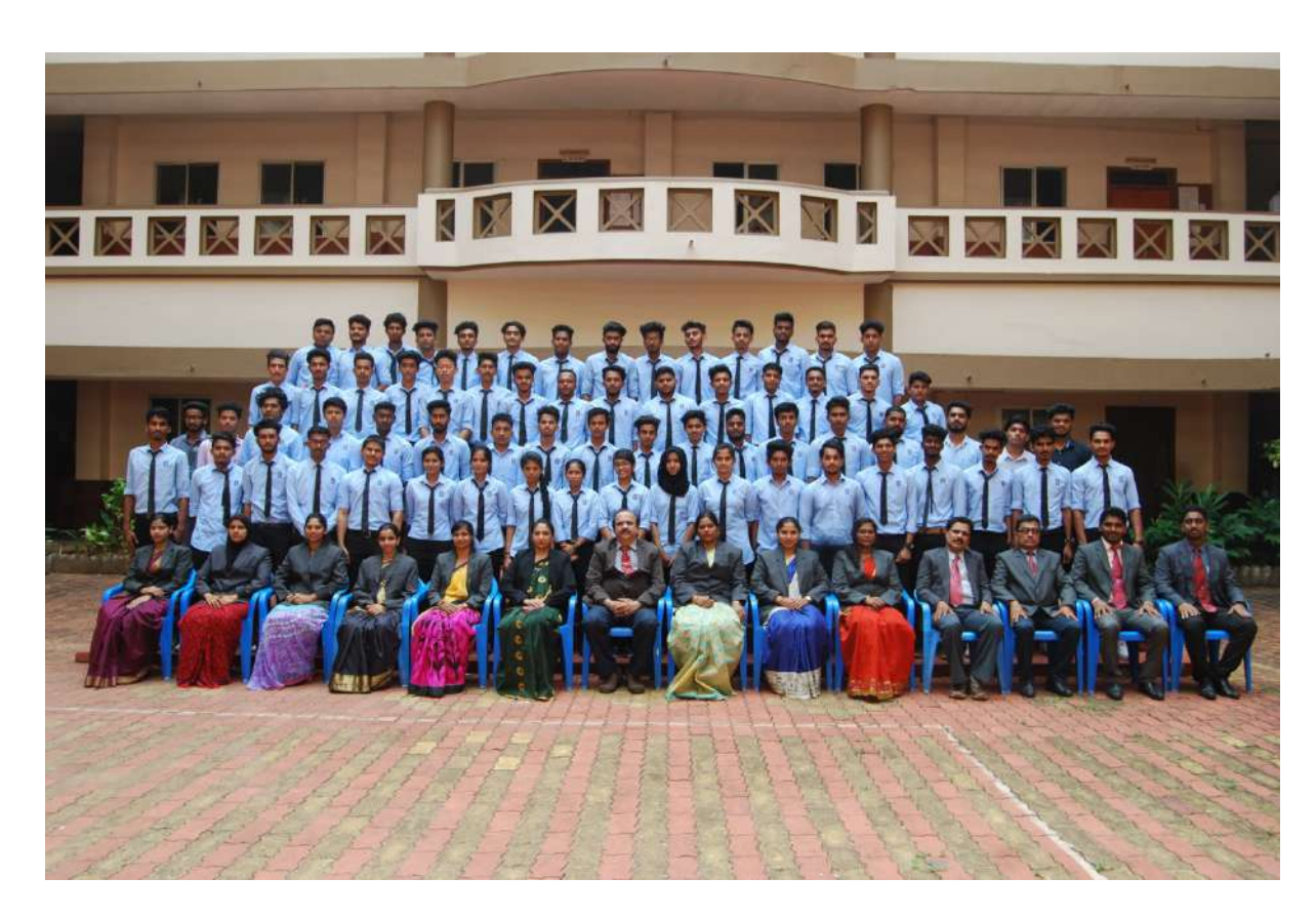
I Semester BBA