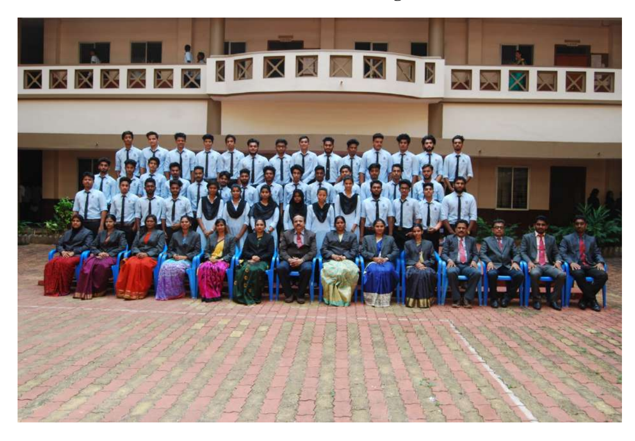
I Semester B.Com.