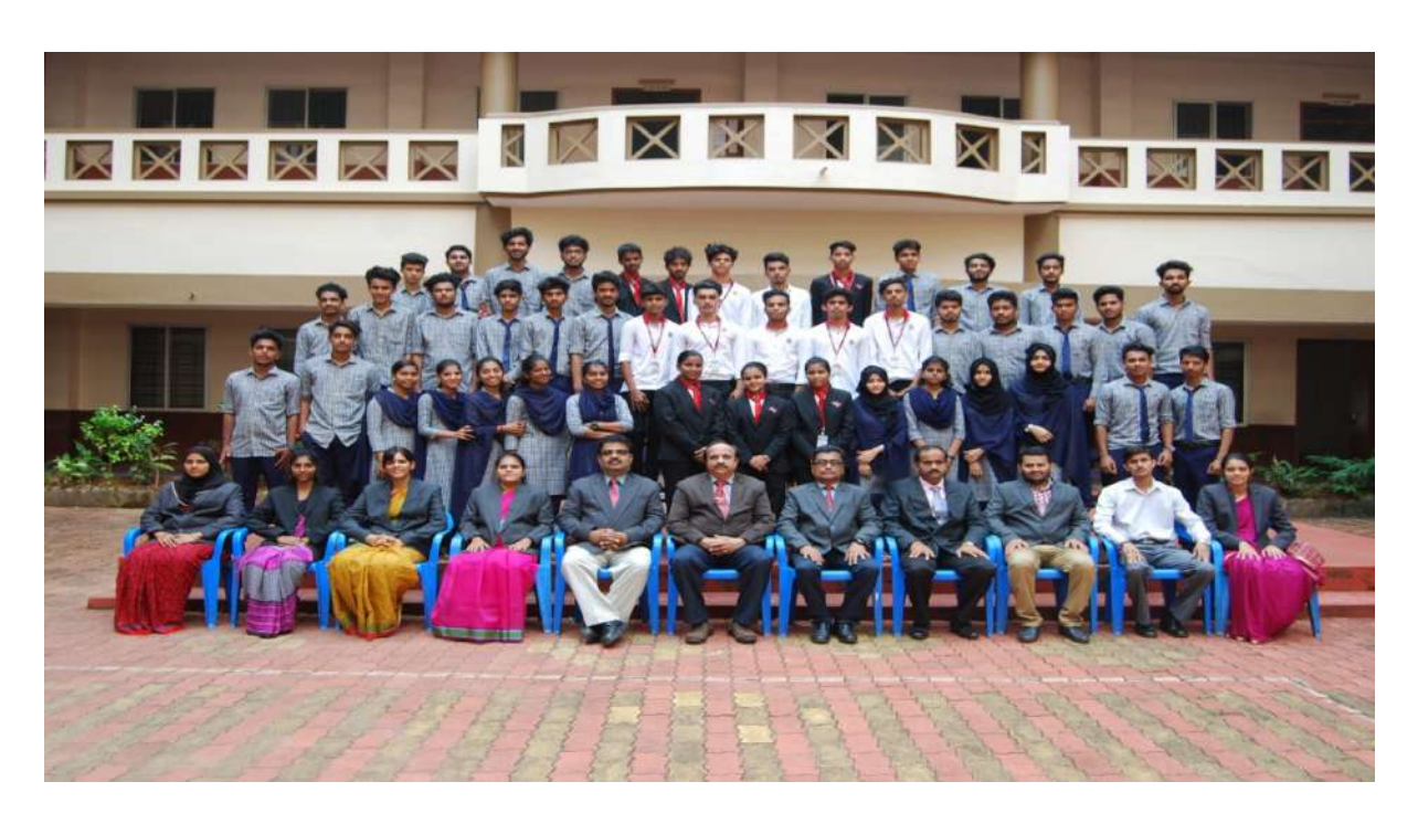
I Semester BCA