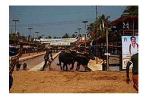
Figure 4. Kambala