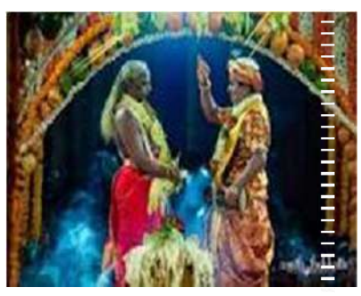
Figure 5. Nagamandala