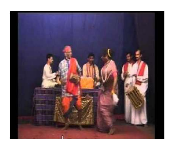
Fig 1. Tenkudittu Yakshagana costumes and backround musicians.