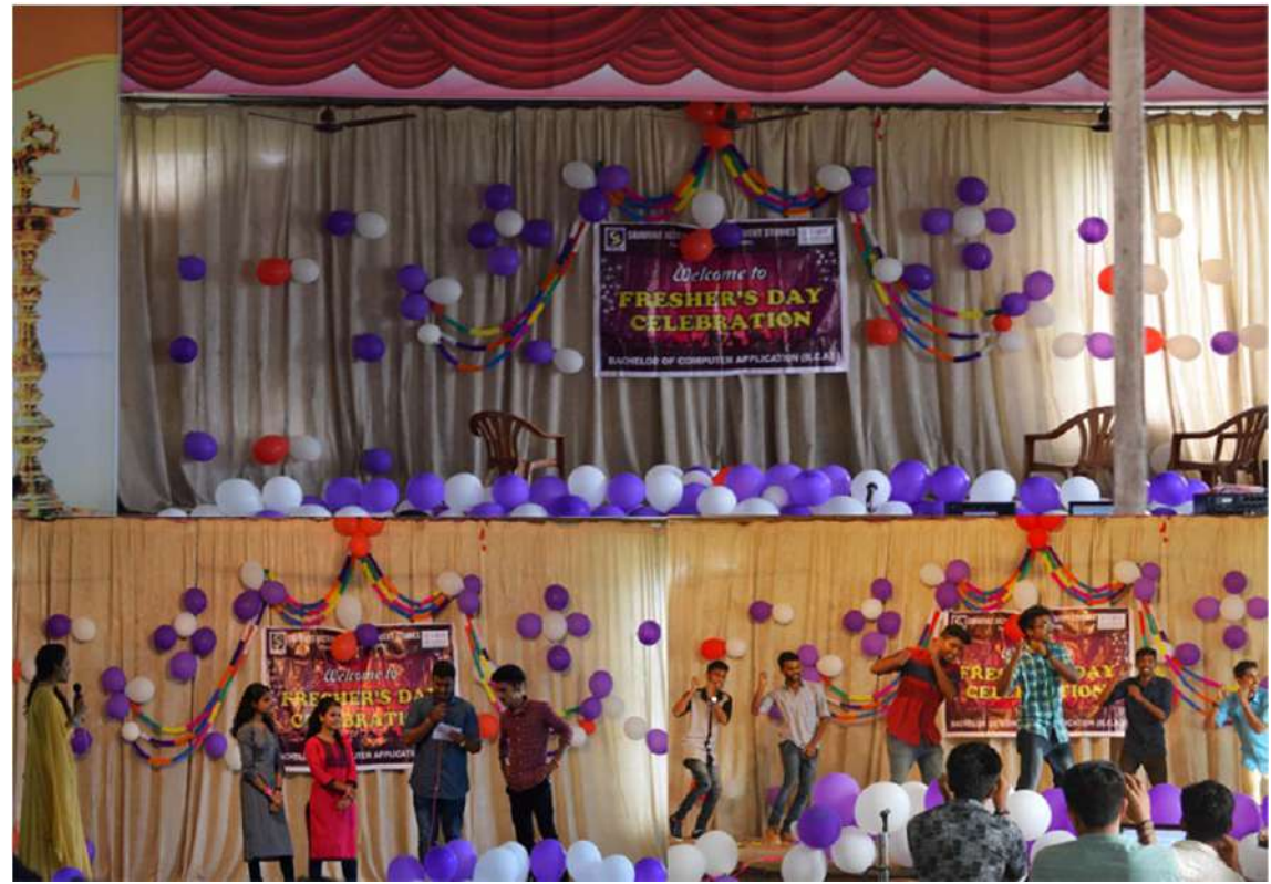
Fresher's Day Celebration by BCA Program under College of Computer and Information Sciences

BCA program under College of Computer and Information Sciences organized Fresher's day program on 23-08-2017 for I BCA students in the auditorium of the college. It was a day which was filled with excitement and joy. The students performed cultural shows. Various exciting games were organized by the seniors for the new comers welcoming the fresh batch students. Senior students and newcomers mingled each other. All the students together rocked the show.