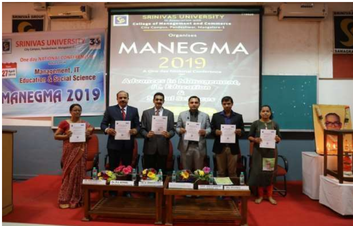
MANEGMA-2019, One day National Conference at Srinivas University